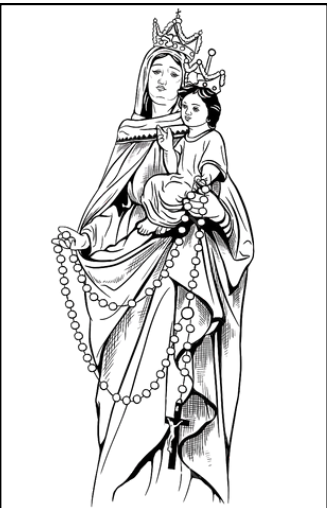
Our Lady of Victory, Pray for us!